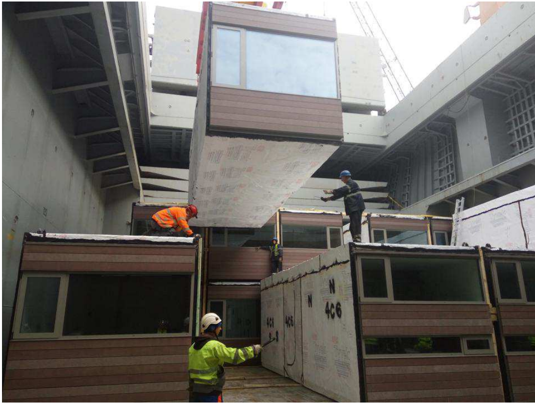
Fully completed hotel room modules cross the Atlantic Ocean from Poland to New York Harbor via container ship.

public areas, such as the restaurant and lobby will be constructed using traditional methods.