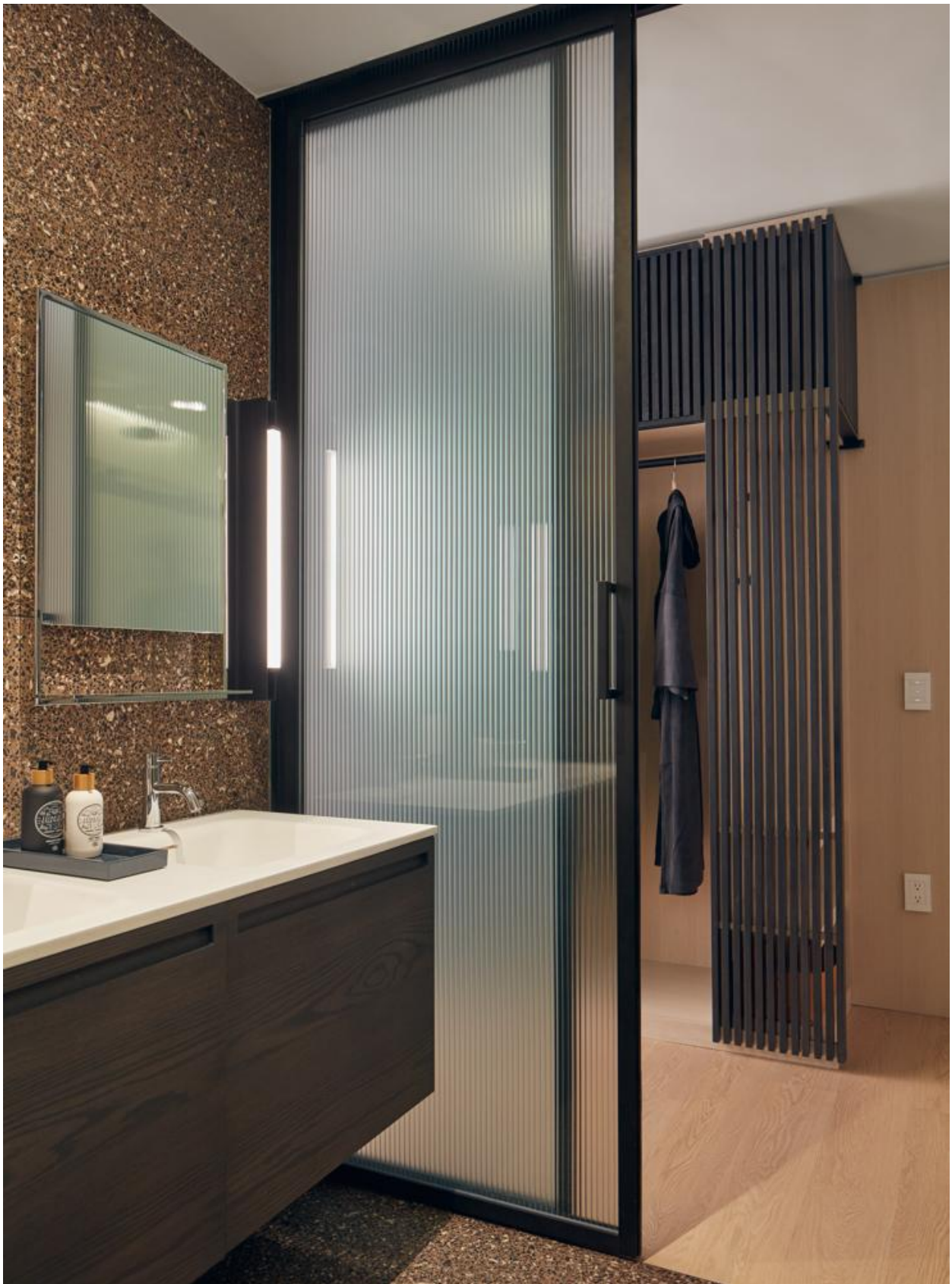
wallpaper.com (https://www.wallpaper.com/architecture/modular-architecture-mitek-danny-forster-and-architecture-usa) · by Wallpaper* Magazine · May 22, 2021